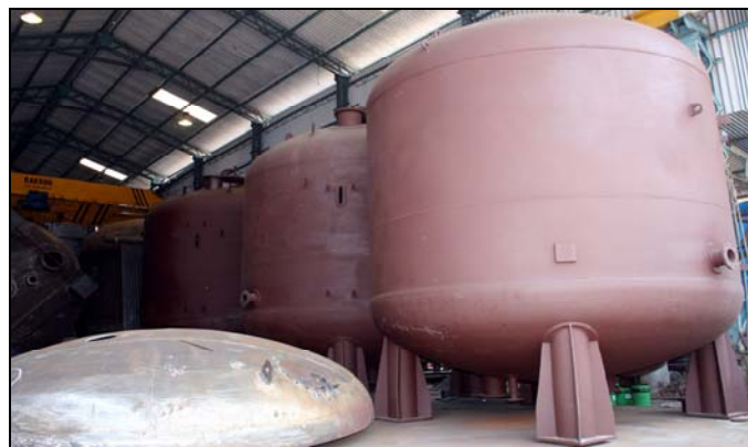
Rakhoh engineering Pvt. Ltd.