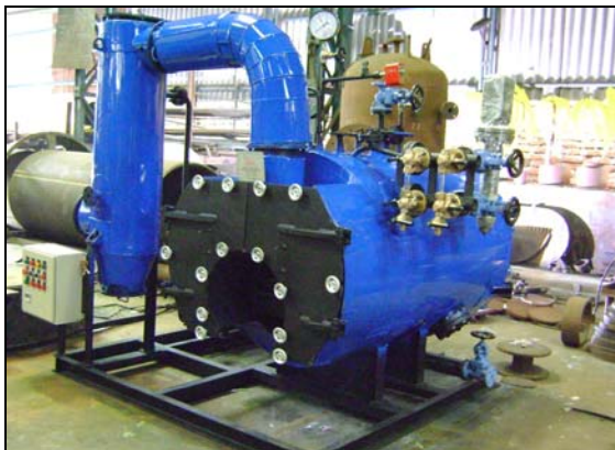
Sanaea Engineering Services Pvt. Ltd.